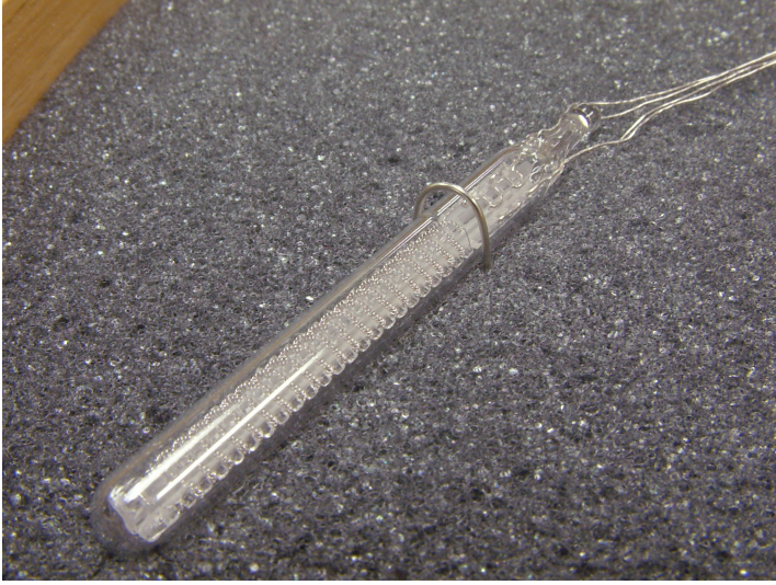
Figure 3: Standard platinum resistance thermometer 5

to assess temperatures ranging from approximately 10 K to 1300 K, with accuracy below 1 mK across most of this range with a single instrument. 4